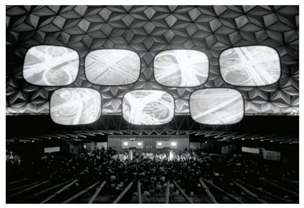
68. Installation view of Glimpses of the U.S.A., American National Exhibition, Moscow, 1959. (Eames Office LLC).

duty, while some of their finest works, Powers of ten and Think , were made to hone the public image of corporations like IBM.