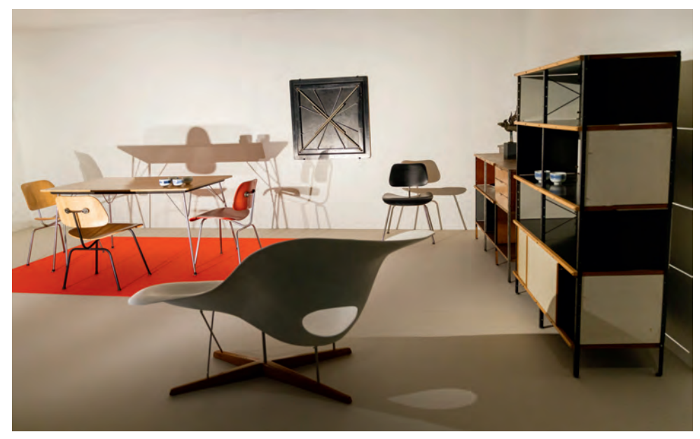
66. Installation view of The World of Charles and Ray Eames at the Barbican Art Gallery, London, 2015, showing the recreation of the Eames Office room display for the exhibition Modem Living at the Detroit Institute of Arts, 1949.

Eames Office in the crucial early days. Other essays included Beatriz Colomina's penetrating study of the Eames House and Helène Lipstadt's analysis of the Eames Office's interaction with government agencies and corporate America against the backdrop of the Cold War. Both the show and the catalogue were widely acclaimed.<sup>1</sup>