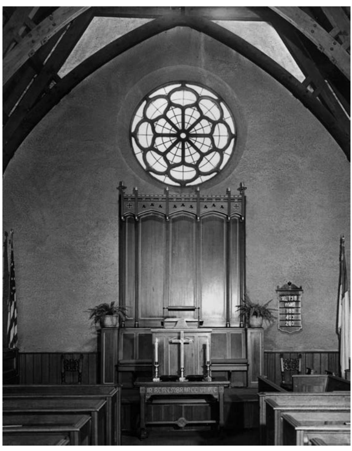
27. Photograph of the interior of the Union Church showing the window prior to Matisse's commission, (Rockefeller Archive Center, New York).

Part of this sense of freedom was due to his practice, from the early 1940s, of having his studio assistants brush Linel gouache paints onto sheets of white paper and then dry them.20 Consequently, when Matisse selected the pre-coloured paper to cut, the choice of materials and colour was being made in 'complete synthesis', a goal he had worked towards for many years: '. . . drawing with scissors on sheets of paper coloured in advance, one movement linking line with colour, contour with surface [. . .] the cut-out paper allows me to draw in colour. It is a