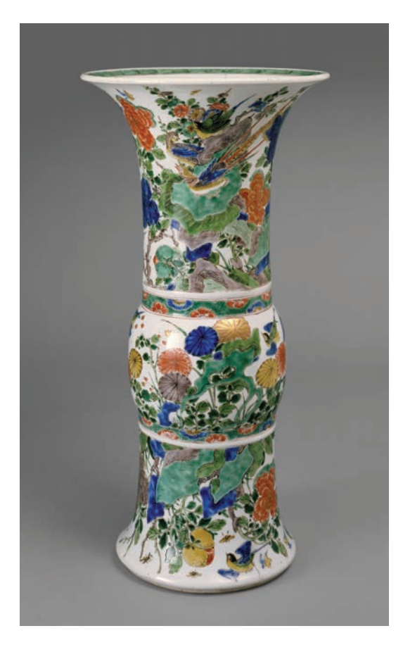
33. Vase. Chinese, Qing Dynasty, Kangxi period, late seventeenth-early eighteenth century. Porcelain painted in overglaze with enamels and gilt, 45.7 cm. high. (John D. Rockefeller Jr bequest, Metropolitan Museum of Art, New York).

Piper's incisive mind linked Matisse's paper cut-outs to his stained-glass windows. This is not an immediately obvious perception, considering one is opaque, the other transparent; one is stuck on to paper, the other embedded into leads. However,