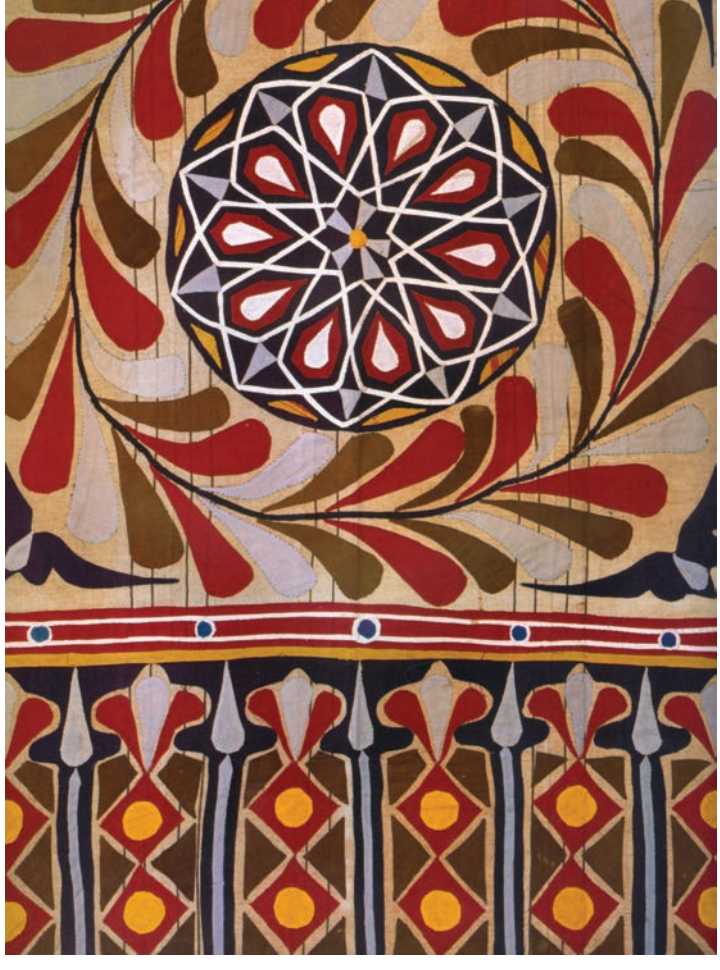
30. Detail of an Egyptian hanging. Nineteenth century. Cotton, 25.5 by 14.4 cm. (Private collection).