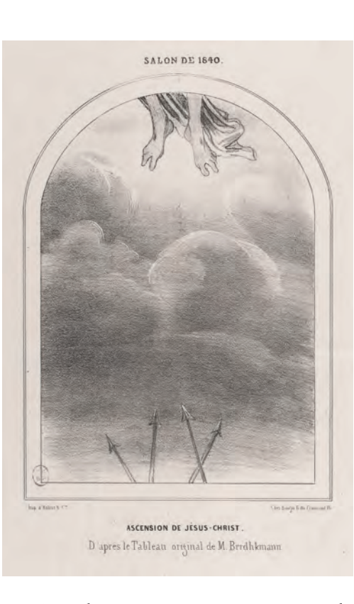
18. Ascension of Christ, by Honoré Daumier. 1840. Lithograph, 34.4 by 24.6 cm. (Bibliothèque nationale de France, Paris).

The Pilgrimage of St Roch , ascribed to the equally fictitious Pétral Vilerrnomz, is a puzzle from the outset. St Roch is traditionally thought of as the patron saint of plague victims and is usually depicted curing the disease or intervening on behalf of those afflicted by it. Jacques-Louis David's representation of the latter scene is among the better-known examples of this theme.<sup>5</sup> According to tradition, St Roch came from Montpellier and decided as a young man to embark on a pilgrimage to Rome. He entered Italy at a time of plague and cured many sufferers by praying for them. Then, while in Piacenza, he succumbed to the illness himself and left the city to live alone in the forest. Here he was nursed by a dog, who brought him bread and licked his wounds. On his recovery, St Roch returned to Montpellier where he was