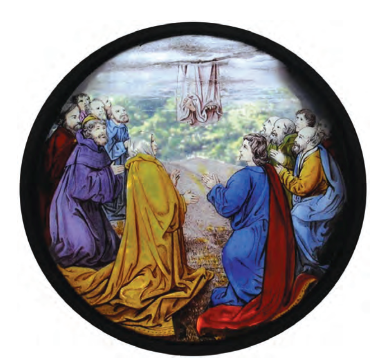
20. Ascension of Christ. Netherlands, c.1580. Painted glass, diameter 22 cm. (University of Bristol).