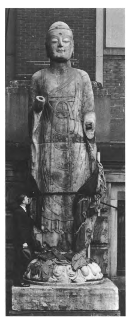
21. The Amitabha Buddha observed by an unknown man. Sui dynasty, 585 A.D. 580 by 203 cm. (British Museum, London).

Dealers in Chinese art were able both to lend to the exhibition and to advertise in the catalogue; as well as C.T. Loo and Sadajiro Yamanaka, other dealers who lent objects included Bluett & Sons, Peter Boode, Spink & Son Ltd (Fig.20) and John Sparks. Loo lent the colossal marble Amitabha Buddha (Fig.21) with inscribed lotus base (no.2360), dated to 585 A.D.