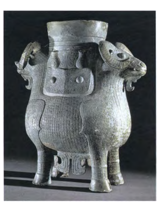
14. Ritual wine vessel in the shape of a pair of rams supporting a jar. Shang dynasty period, thirteenthtwelfth centuries B.C. 43.2 cm. high. (British Museum, London).

In the aftermath of the First World War it had been difficult to secure loans from other European states. Loans from China were even rarer because of its geographical distance and the political revolutions that led to the establishment of the Republic of China in 1911. The 1929 Berlin exhibition included only three works lent from China – from a European collector in Qingdao (Tsingtao), who sent three ceramics dated to the Song dynasty (960–1279).<sup>22</sup> Thus, the extent to which the London organisers aggressively sought works from foreign collections, especially from China and Japan, was a major innovation. To mount such an ambitious exhibition required scholarship, but also business and financial acumen, and the entrée into both private and public collections of Chinese art.