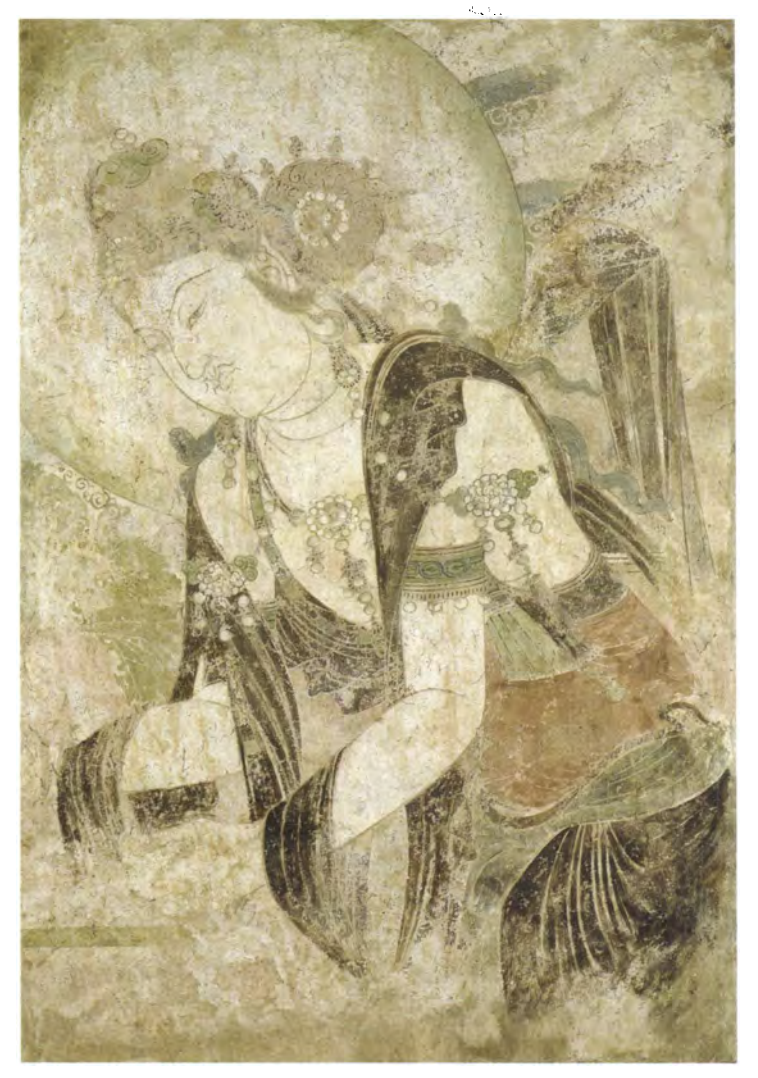
13. Wall painting fragment with Bodhisattva figure. Five Dynasties period, Later Zhou dynasty, c.952 A.D. 84.5 by 57.2 cm. (Art Institute of Chicago).

Given the prevalent spirit of competitiveness and the claims of local and national pride, the mounting of such exhibitions became increasingly complex as the number of objects and costs multiplied. While membership fees and donations covered their operating costs, these organisations had to generate additional financial resources. One source of funds was provided through the direct involvement of art dealers in the exhibitions by inviting them to lend works as well as to advertise in the accompanying catalogues. For example, the catalogue of the Berlin show included twenty-two pages of advertisements along with twenty-eight announcements from dealers in Chinese art with offices throughout Europe, North America and Asia.