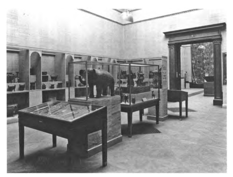
11. Ancient bronzes and jades displayed in Gallery I: Shang-Yin and Chou dynasties.